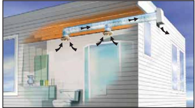
Dual Bathroom Exhaust