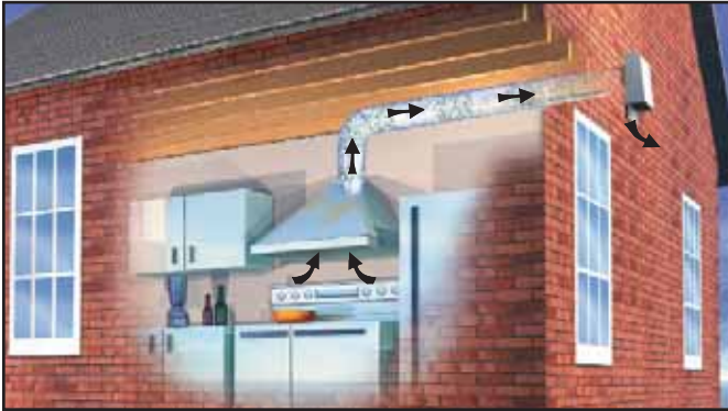
Range Hood Exhaust

Continental Fan's EXT External Mount Duct Fans are the perfect solution when space restrictions prevent the use of in-line duct fans. EXT fans provide a simple through-the-wall solution, and can be sidewall mounted on the exterior of a building to allow for easy access to the fan. EXT fans utilize quiet and energy efficient external rotor motors.